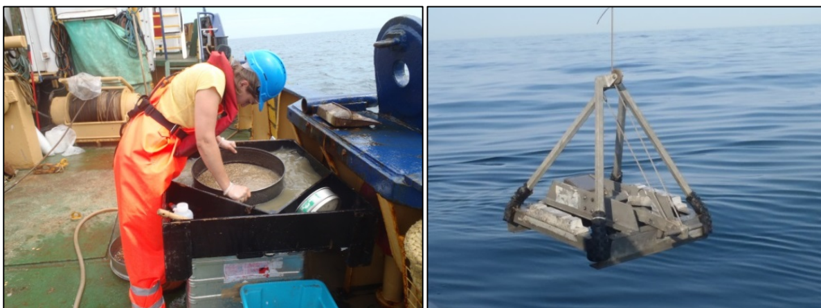
Figure 2. Sieving a grab sample on board (left); deploying a Hamon grab (right).

If chemical analyses are required, a stainless-steel grab must be used, with sub-samples collected for different chemical analyses. Sample containers will generally be supplied by the analysing laboratory. A plastic scoop should be used to remove samples for metal analysis samples, while a stainless steel or aluminium scoop should be used to remove samples for analysis of organic compounds. The analysing laboratory can advise on the amount of sediment required based on the analyses to be conducted.